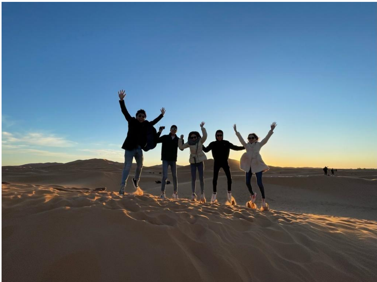
Picture 1: Visiting the desert with friends I met during my exchange

Going on an exchange was one of the greatest choices I have ever made. I have met a lot of wonderful people and had the opportunity to study and experience a lot of things that I never would have been able to accomplish in Hong Kong. My schoolmates were super welcoming and open. I have developed some close friendships. They constantly check on me to make sure everything is fine, and I know I can always turn to them if I need anything. My schoolmates also come from very diverse cultural backgrounds – the professor did a survey on our nationalities in one of my classes, and the cultural demographics was extremely diverse.