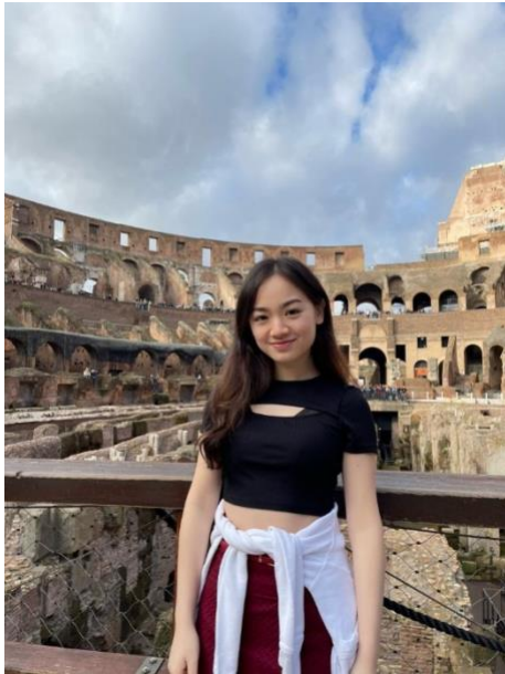
Picture 2 and 3: Walking through ancient ruins in different Europe countries

Aside from studying, some Hong Kong friends and I also went on some trips. I have visited Nice, Rome, Amsterdam, Paris and other cities. I also had a road trip in Morocco. The excursions we have taken have been wonderful opportunities to see the world and get to know the history, cultures and people who in places so different from Hong Kong and try on traditional cuisines . I have had a great time everywhere we have been able to travel.